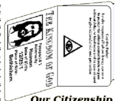
Our Citizenship Is In Heaven